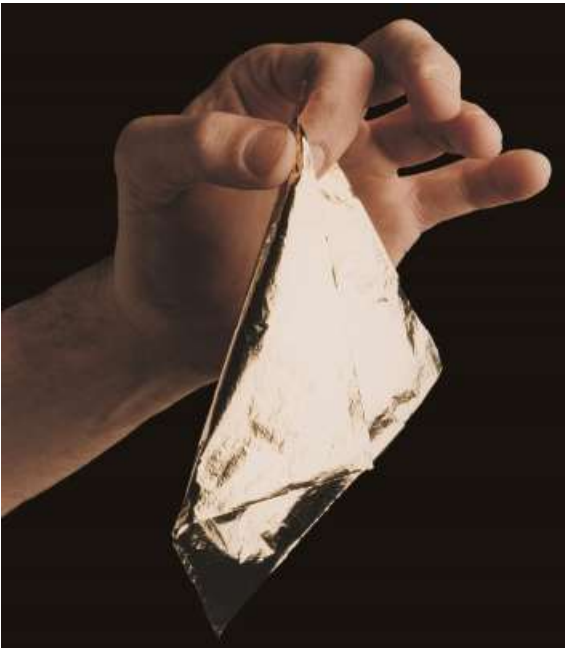
Nigel Rolfe, Gold Leaf , 1993, colour photograph, 89 x 89cm (unframed), gift of the artist 1993